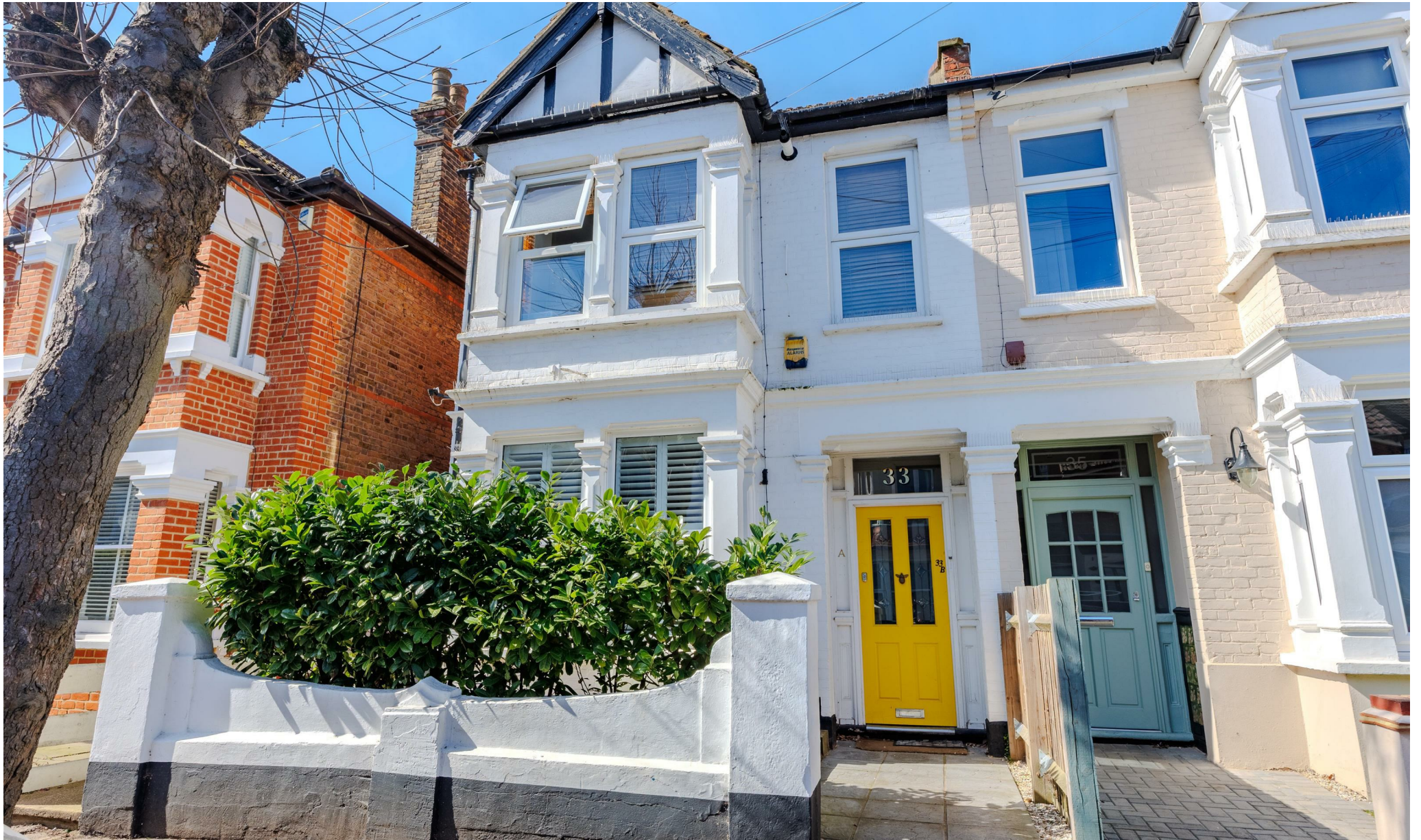
Leigh Hall Road, Leigh-On-Sea £1,250 PCM